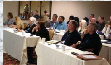
RIGHT: Conference Attendees